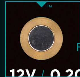
Rigid Brass Housing