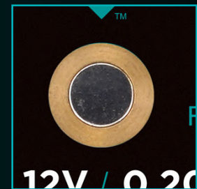
Rigid Brass Housing